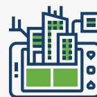
AR and VR Solutions for Real Estate