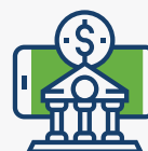
Real Estate Transaction Standard (RETS) Integration