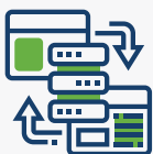
Custom Internet Data Exchange (IDX) integration