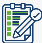
Multiple Listing Service (MLS) Software