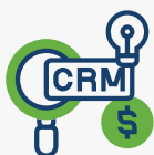
Real Estate CRM Software

Our clients from the real estate industry rely on Kellton Tech to transform their business operations, improve data quality and achieve higher margins, while lowering operational risk and costs. Along with delivering operational efficiencies through our state-of-the-art solutions, we help unlock new avenues of growth. Kellton Tech, with its immense technological domain expertise, is well suited to partner with businesses enabling them to outclass competition by providing comprehensive real estate technology solutions.